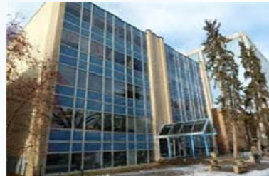
ARCH Psychological Services

Parking is available on 106th street and 99th avenue. Daily parking available off 107th Street and 100th Avenue